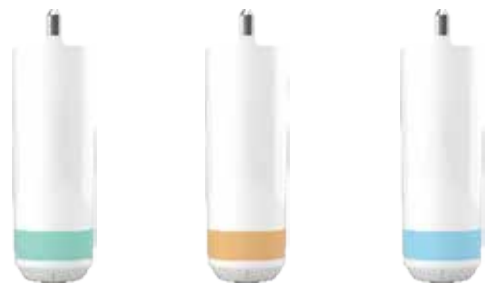
B-1.5 B-3.0 B-4.5

The world's first circular "micropulse ultrasound" collaborative technology for circular hand tools, ultra-sonic linear lattice focusing, can maximize the operating effect; in addition to improving, it also brings an additional sense of tightness; multiple modes can effectively reduce pain compared to traditional ultra-sound modes.