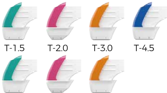
T-1.5 T-2.0 T-3.0 T-4.5 T-6.0 T-9.0 T-13.0

The advantages of flat hand tools are targeted at the skin layer to the superficial adipose membrane layer, fat layer, muscle layer, and are customized in all directions according to different skin types, operating areas, and tissue levels.